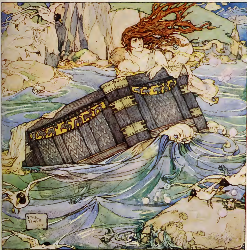
DANAE AND PERSEUS